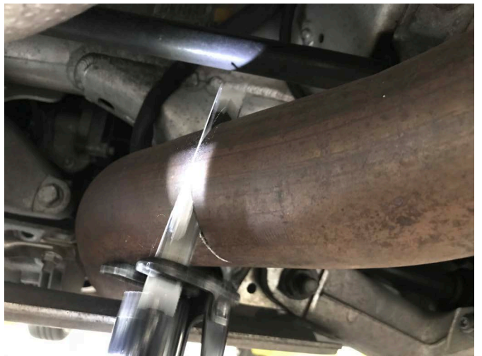
Pictured Right: Cut the exhaust tubing with the method of your choice. We recommend a reciprocating saw. Clean up any rough edges with sandpaper or a file.