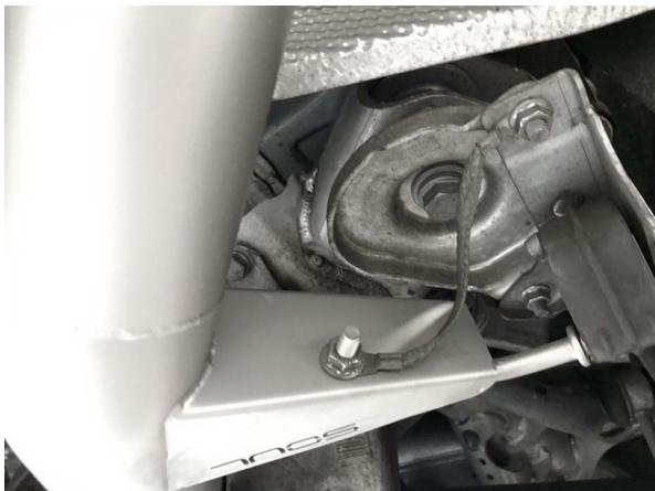
Pictured Left: Reattach the exhaust grounding straps.