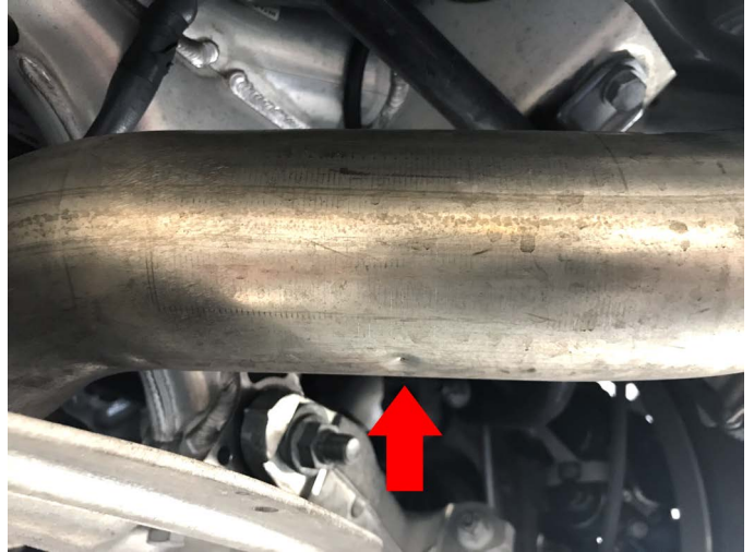
Pictured Right: Locate the OEM factory cut point / dimples on the underside of the exhaust