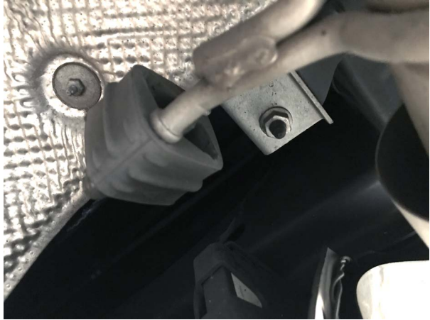
Pictured Left: Unbolt the factory exhaust hangers to release the factory rear mufflers from the car.